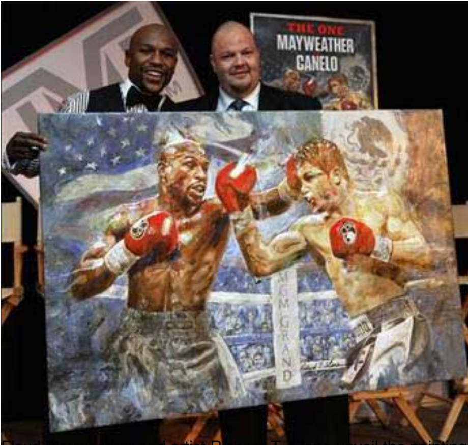
Two men hold the painting in Las Vegas.

Written by The Sweet Science Wednesday, 21 August 2013 09:45