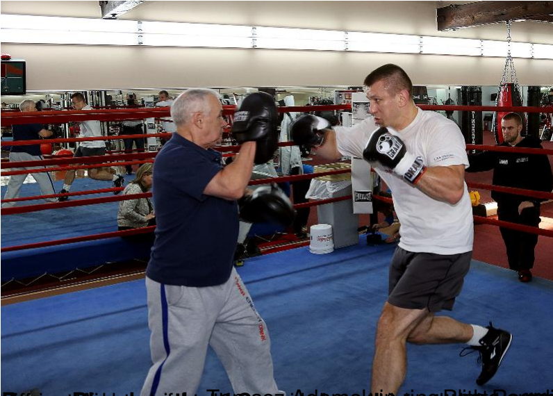
Adamek sparring with trainer in boxing ring

Written by The Sweet Science Saturday, 15 December 2012 16:26