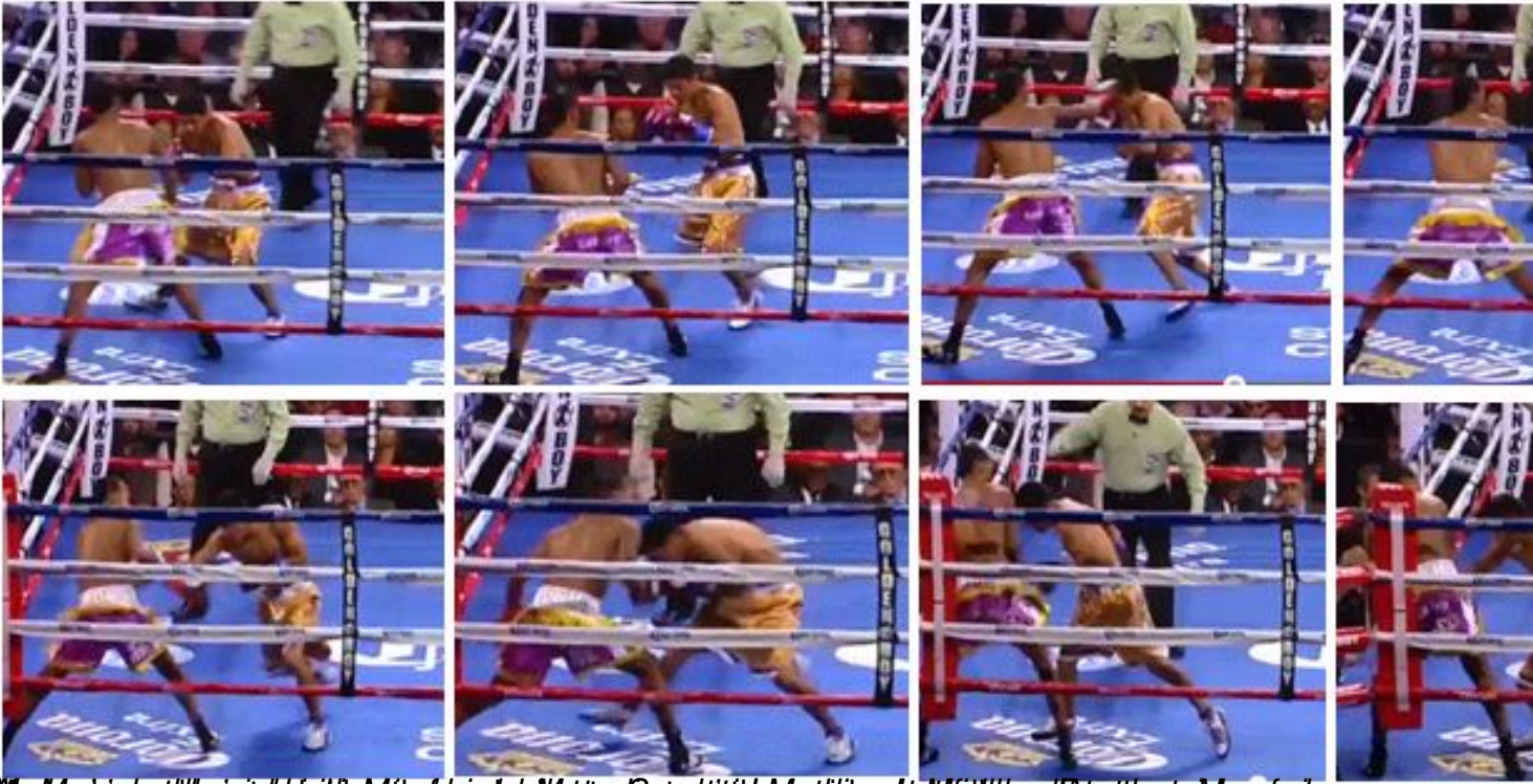
World's best... Mares... Moreno... Golden Boy... Round 2 of 12