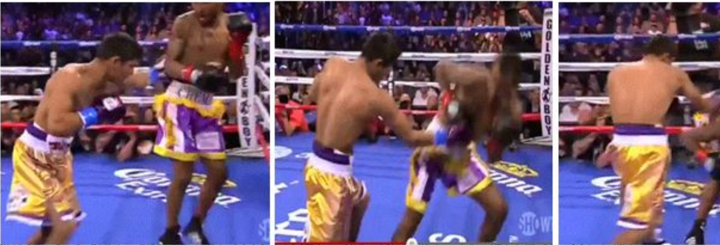
Big... Mares... Moreno... Golden Boy... Round 2 of 12