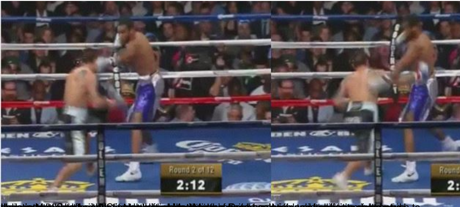
The timing of this shot is crucial. It's a perfect example of Matthyse's technique, which is not just about power but also about precision and timing. This shot is a key moment in the fight, showing Matthyse's ability to land a clean, powerful blow.

Written by Lee Wylie Tuesday, 21 May 2013 10:05