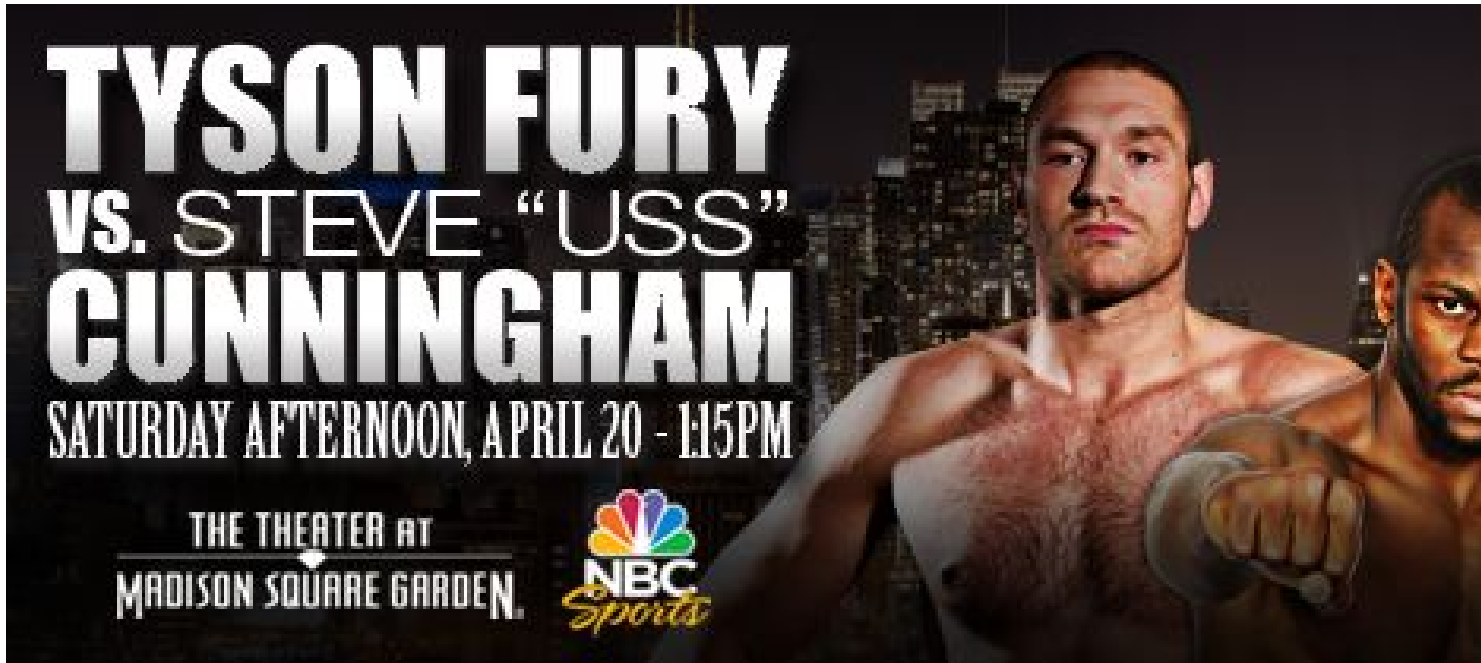
am Holds Media Workout In Preparation For Tyson Fury

Written by The Sweet Science Thursday, 04 April 2013 19:22